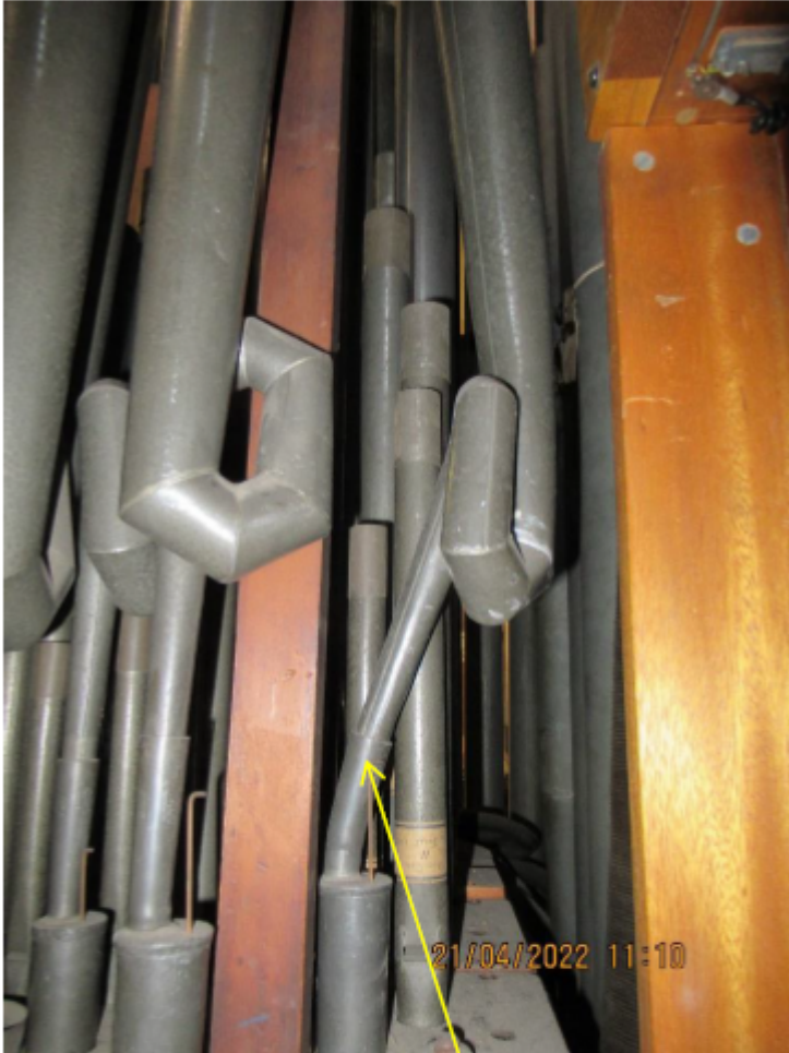
Collapsed resonators Great 8' Tromba

The organ is in urgent need of repair – the below images indicate some of the elements that require overdue attention in this organ.